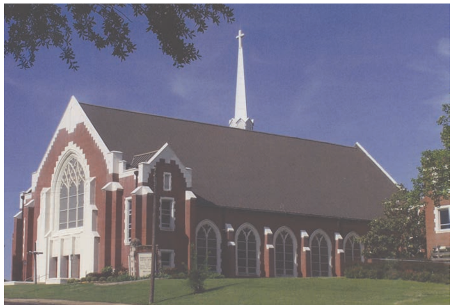
WOODLAND HILLS BAPTIST CHURCH